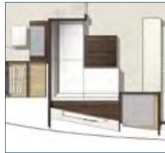
LOWER DECK OPTION Extended galley arrangement with optional outboard appliance