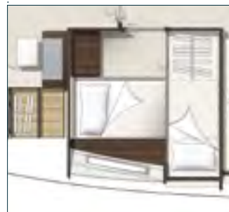
LOWER DECK OPTION Port twin guest cabin in lieu of VIP cabin walk-in-wardrobe